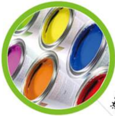
油墨胶浆 Ink Mortar