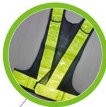
反光材料涂层 Reflective Material Coating