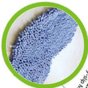
防滑脚垫滴胶 Epoxy-slip Mats