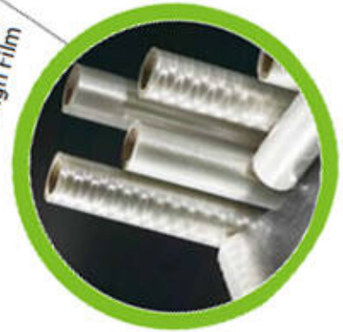
高光膜 High Film