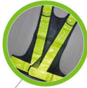
反光材料涂层 Reflective Material Coating