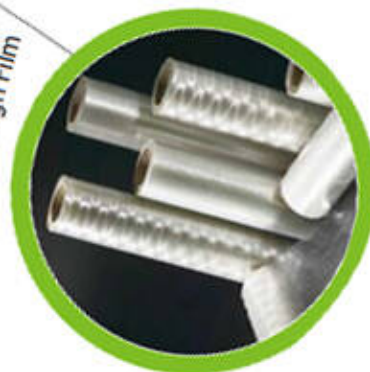
高光膜 High Film